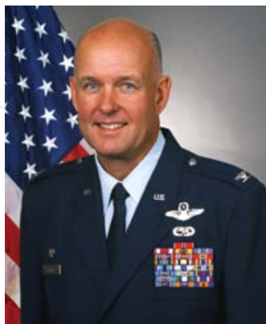
By Col. Pete Hronek 120th Fighter Wing Commander