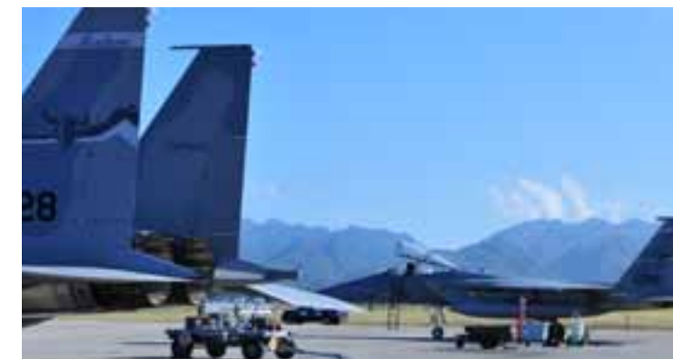
Above: Two Montana Air National Guard F-15 Eagles sit on the ramp at Joint Base Pearl Harbor-Hickam, Hawaii.