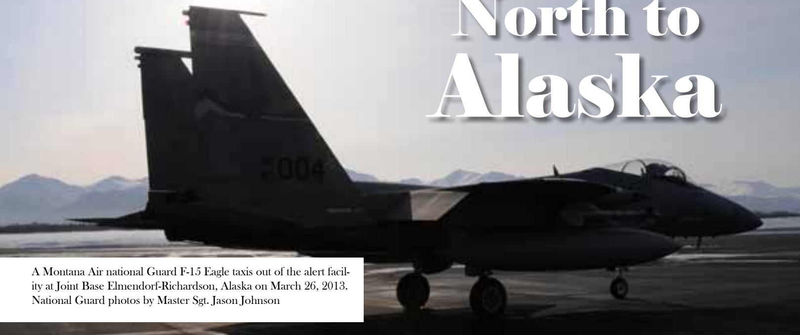
A Montana Air National Guard F-15 Eagle taxis out of the alert facility at Joint Base Elmendorf-Richardson, Alaska on March 26, 2013.