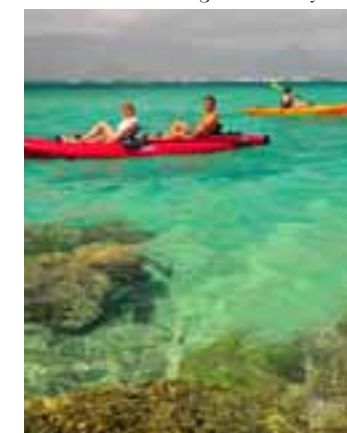
Below: Hawaii and Alaska both offered amazing opportunities to photograph the unique activities and environments.