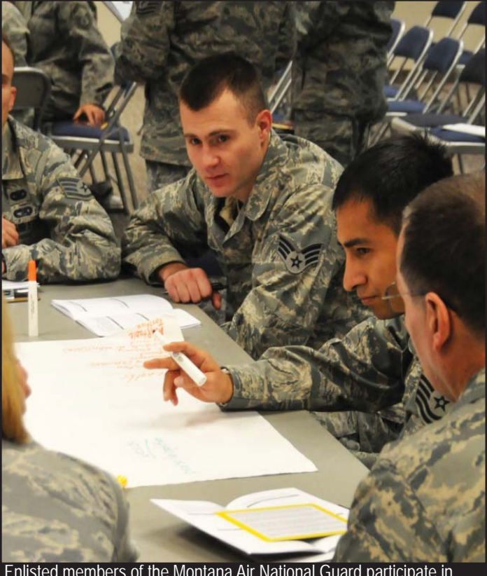
Enlisted members of the Montana Air National Guard participate in the enlisted continuing process improvement event held at the 120th Fighter Wing in Great Falls, Mont. on Nov. 2, 2013.