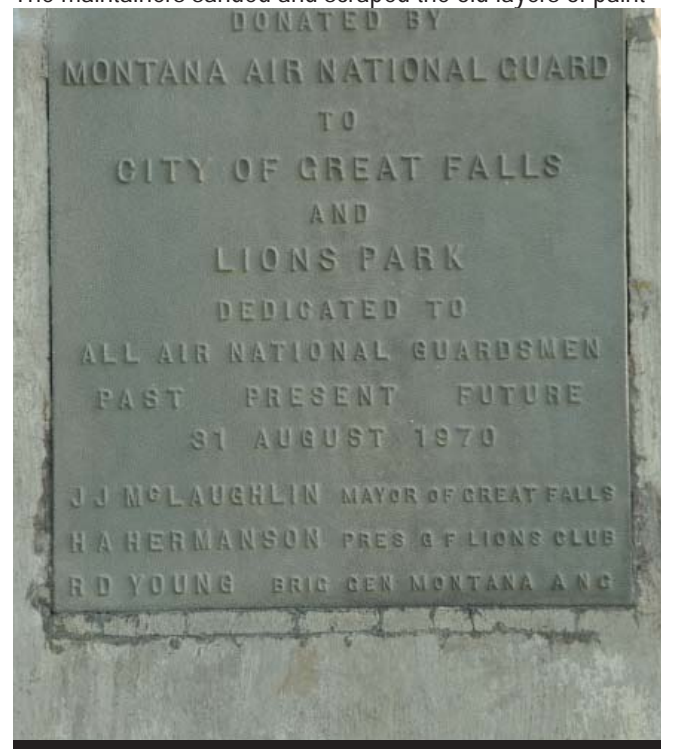
A bronze plaque is affixed to the base of the F-102 in Great Falls' Lion's Park dedicating the memorial to all Montana Air National Guardsmen past, present and future.

The aircraft was carefully prepared for painting. The maintainers sanded and scraped the old layers of paint