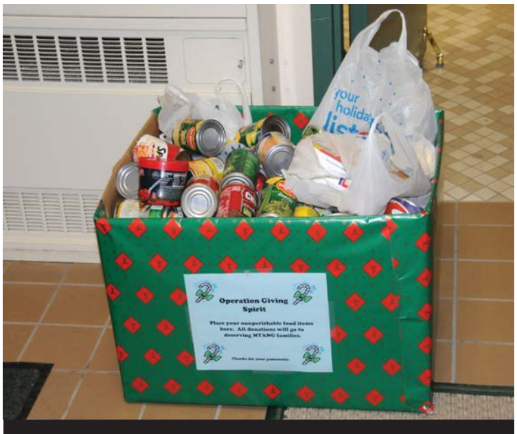
An "Operation Giving Spirit" box sits full of canned goods at the entrance of the Dining Facility on Dec. 18, 2009. Similar boxes will be distributed around the 120th Fighter Wing to collect food for this year's event.

Fresh turkeys will also be purchased using the donated funds and placed in the food boxes to be delivered to local Guard families.