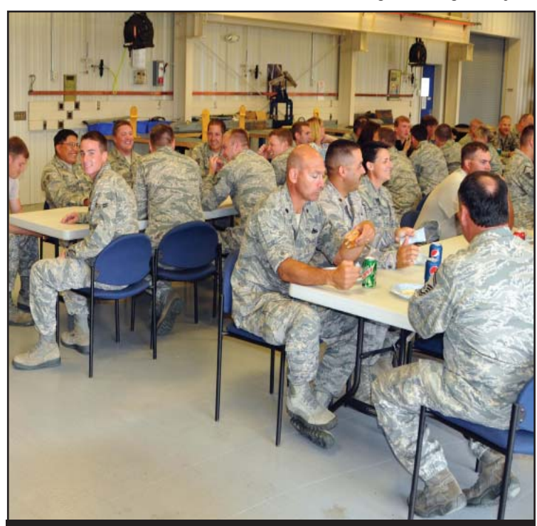
120th Fighter Wing Weapons Element members, retirees, family members and wing leadership gather together for a lunch to celebrate the weapons career field on Sept. 7, 2013 at the 120th Fighter Wing in Great Falls, Mont.

"This is the end of an era," said 120th Fighter Wing Safety