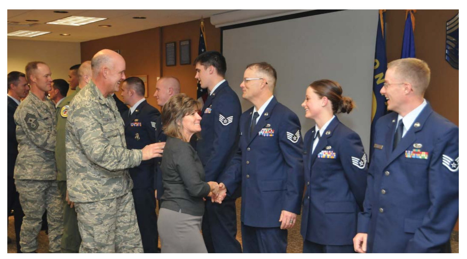
Big Sky Flyer November 2013 8