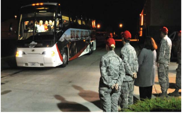
Members of the 219th RED HORSE Squadron wish deploying personnel well as they board a bus bound for Colorado to support flood relief efforts on Oct. 11, 2013.

In the flood-damaged location, the North Saint Vrain Creek had breached its banks and was running far from its normal channel. The flooding destroyed home foundations located near the original river. The Guardsmen planned on returning the river to