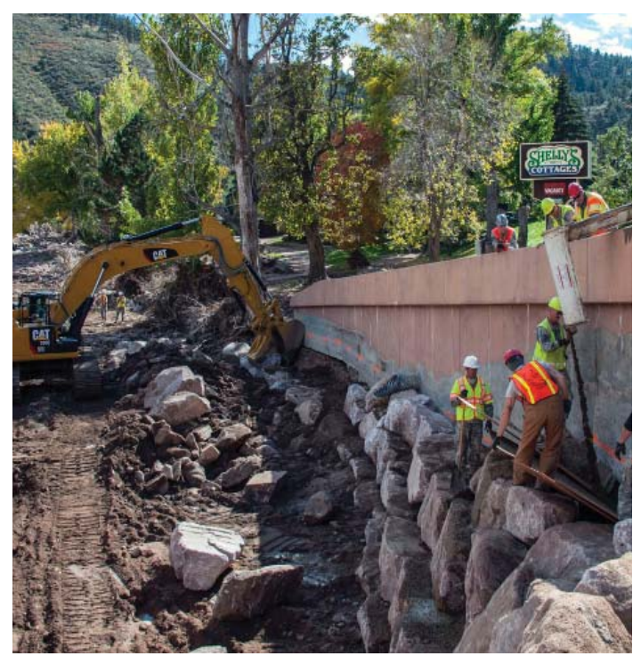
Members of the 219th RED HORSE Squadron of the Montana Air National Guard build a retaining wall for the North Saint Vrain Creek on Oct 21, 2013. The unit deployed to Colorado to assist in flood relief efforts.

its original riverbank to allow homeowners to reclaim their property.