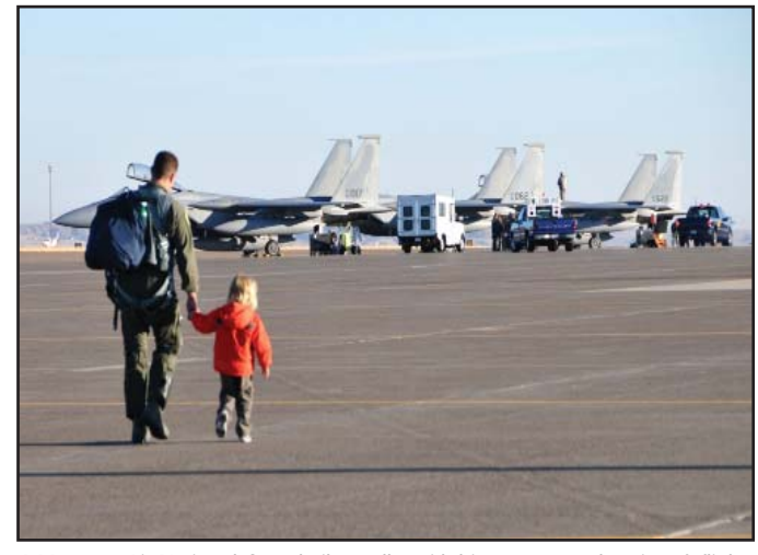
A Montana Air National Guard pilot walks with his son out to the aircraft flight-line Oct. 24, 2013.

Once all aircraft were airborne, the three fighters