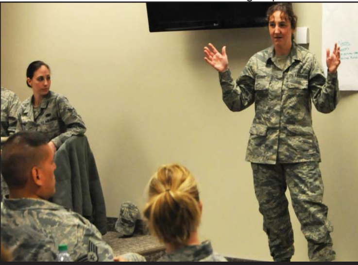
Enlisted members of the Montana Air National Guard participate in the enlisted continuing process improvement event held at the 120th Fighter Wing in Great Falls, Mont. on Nov. 2, 2013.

The program organizers had identified perceived problems in Air Force Specialty Code (AFSC) training programs, Professional Military Education (PME) testing and the retention and recognition programs that the group could address. As each issue was discussed, facilitators logged the comments and solutions offered from members of the group into a com-