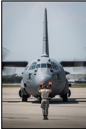
An Airman marshals a C-130 Hercules aircraft at the Air National Guard's Air Dominance Center in Savannah, Ga., during the Maintenance University June 13, 2016.