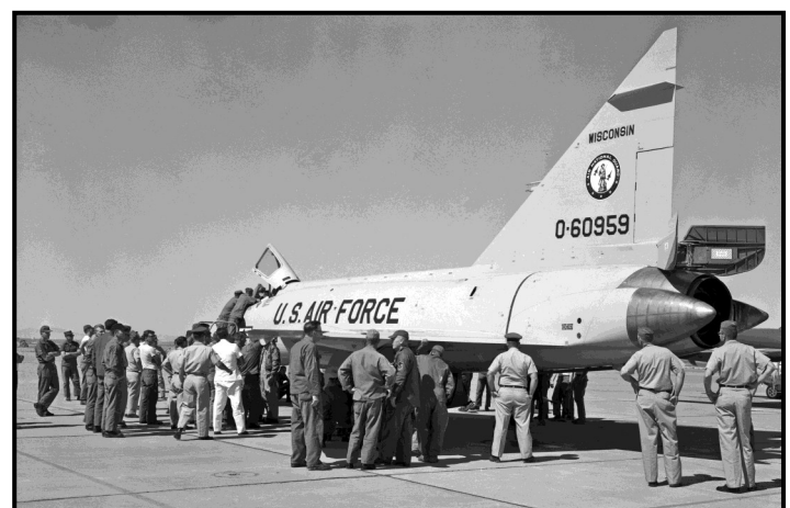
120th Fighter Group personnel gather together on the flight line to inspect the first F-102 Delta Dagger to arrive at the base in Great Falls July 29, 1966.

The first of August will bring to the Montana Air National Guard an Air Force mobile training detachment (MTD) to instruct aircraft maintenance personnel in all the intricacies of F-102 repairing and maintaining. The group of instructors and their demonstration devices will be here for about six months. It is hoped that as many as possible 120th CAMRON personnel will be able to take in some of the training. Air Techs, of course, will be in the school for as long as it takes to learn the business.