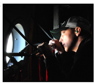
outreach, recognition and educa- CLICK FOR COMPLETE STORY

On the agenda for the day were briefings by Montana Air National Guard leadership and an orientation flight aboard one of the unit's C-