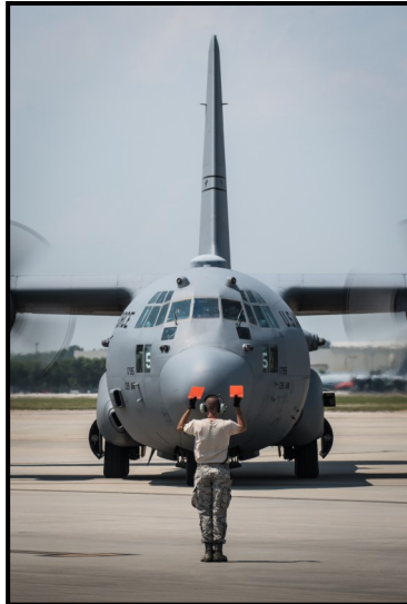
An Airman marshals a C-130 Hercules aircraft at the Air National Guard's Air Dominance Center in Savannah, Ga., during the Maintenance University June 13, 2016.