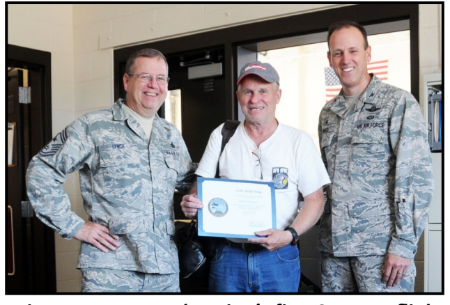
Retiree returns to take wing's first Space-A flight

I believe that we all long to make a difference and to have significance in our lives. As Airmen, we are even more driven to make a difference in the lives of others; our core values instill this drive into us. There was a best-selling book a few years ago about the issue of significance and purpose titled, "The Purpose Driven Life." This book captivated the world as it explored significance issues; CLICK FOR COMPLETE STORY